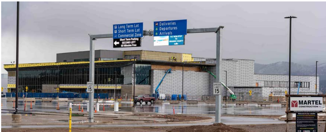
Airport entrance with enhanced entryway signage