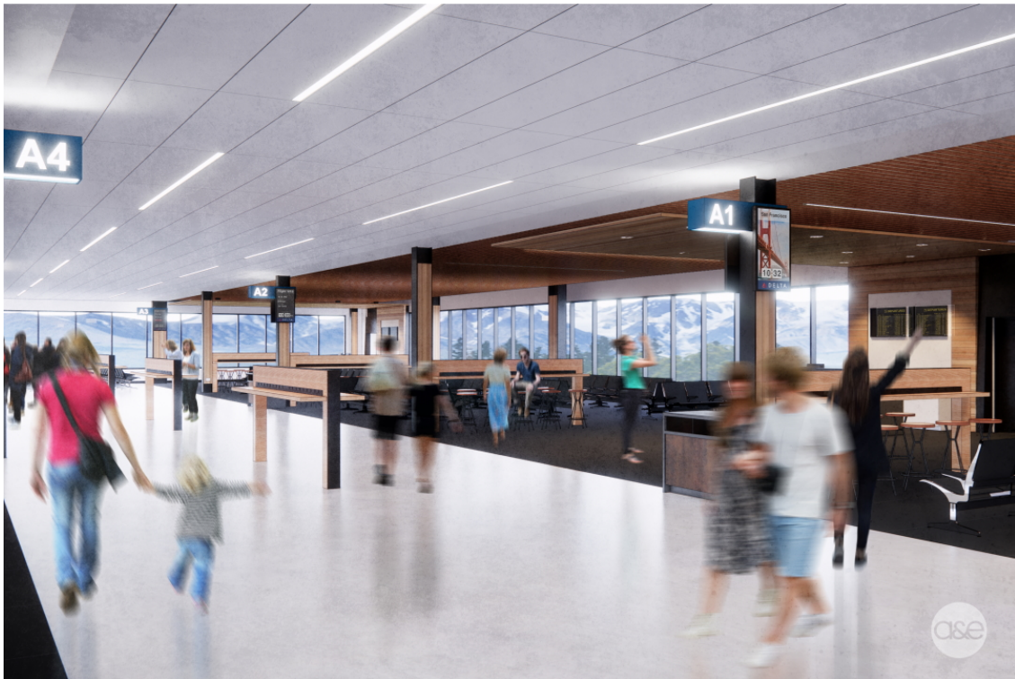
Second level concourse and gate area