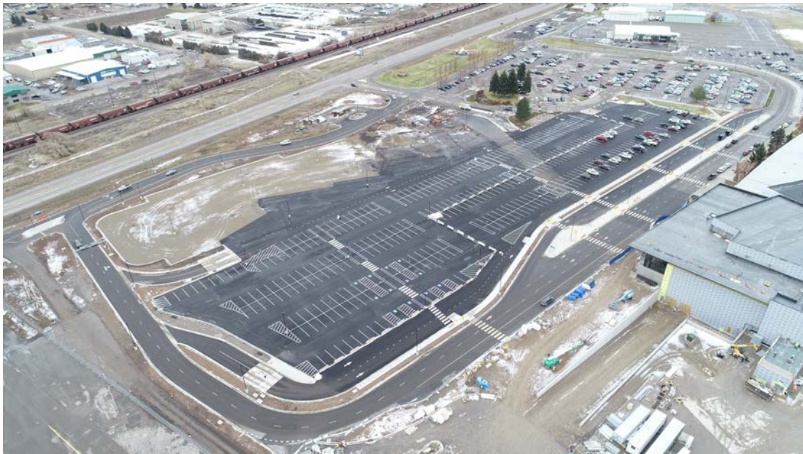
Partially completed parking lot expansion