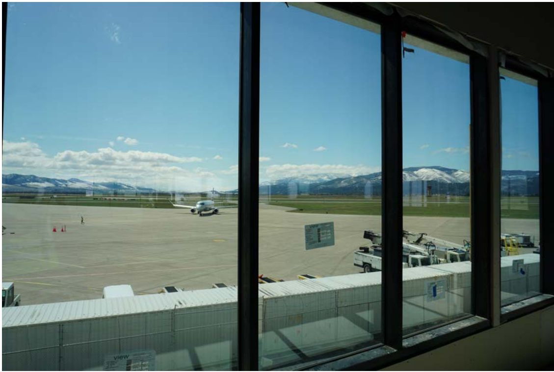
Gates with a "VIEW"! Our new hold rooms will feature a state-of-the-art window system from VIEW Smart Glass, see below for more information.