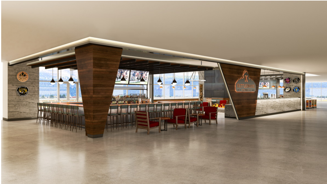
Coldsmoke Tavern on the main concourse