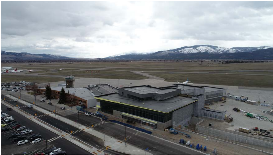
Aerial view of the South Concourse