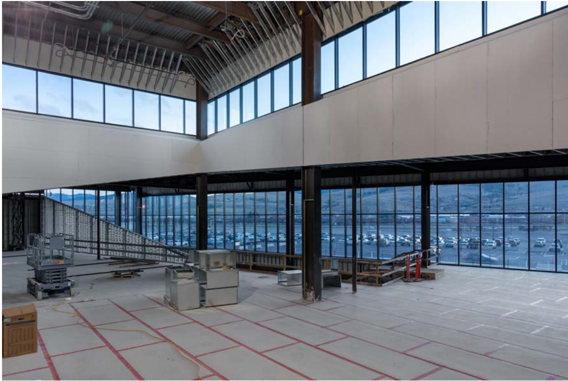
Level 3 view of meet and greet area below