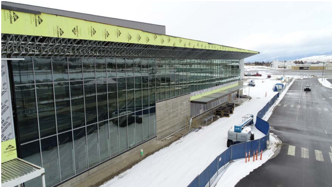
Front view of the South Concourse