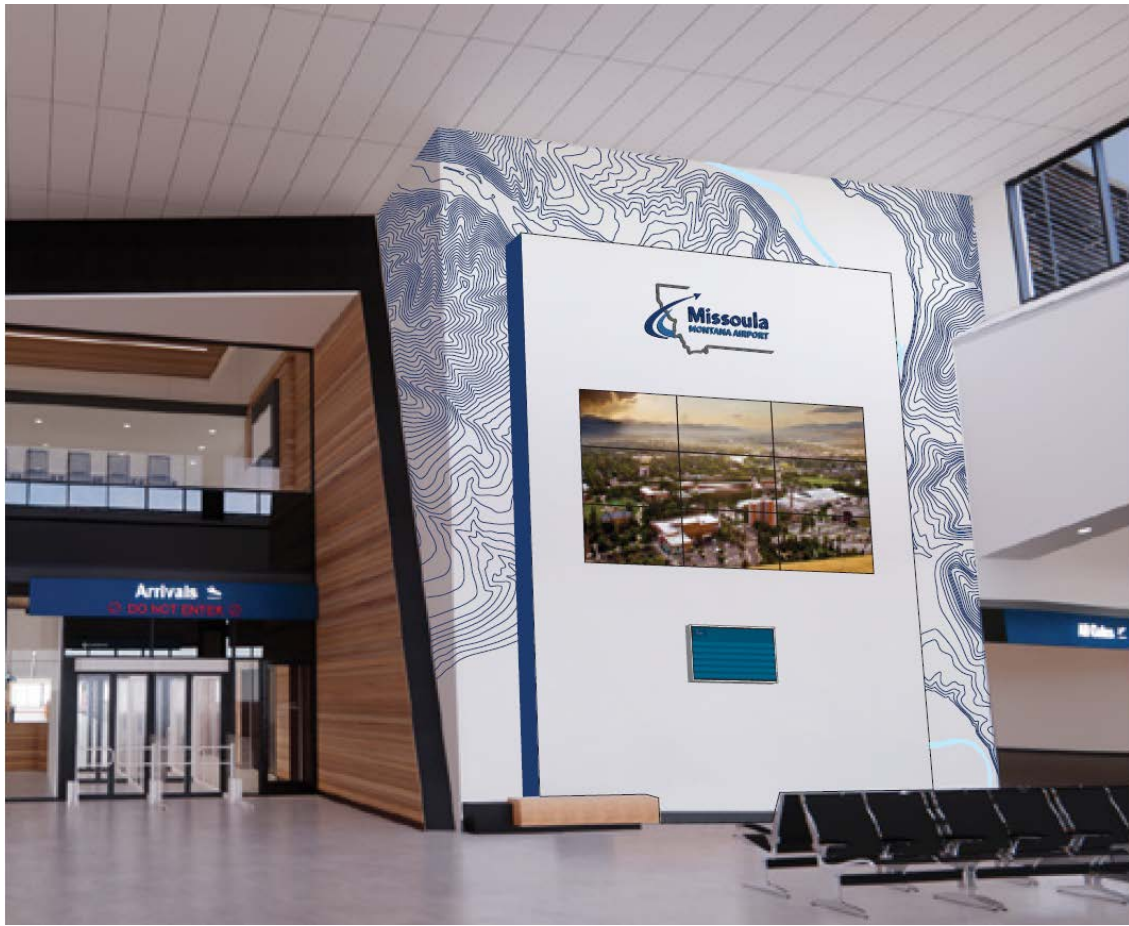
Second level meet and greet area