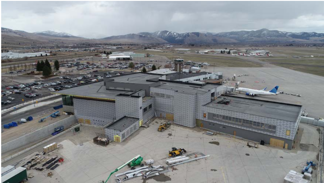
Aerial view of the South Concourse