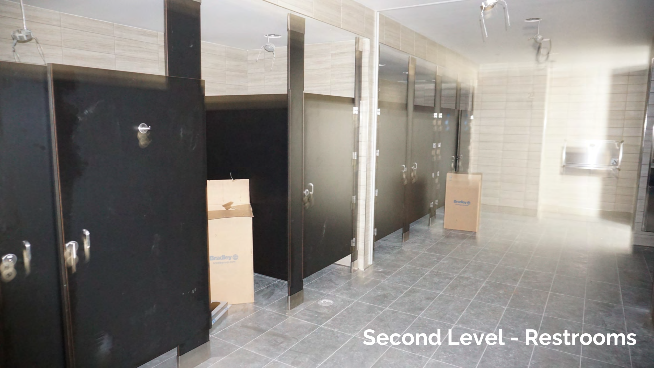
Second Level - Restrooms