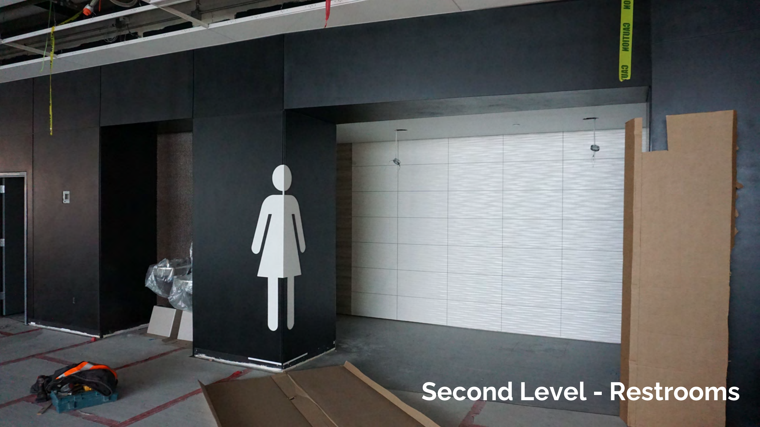
Second Level - Restrooms