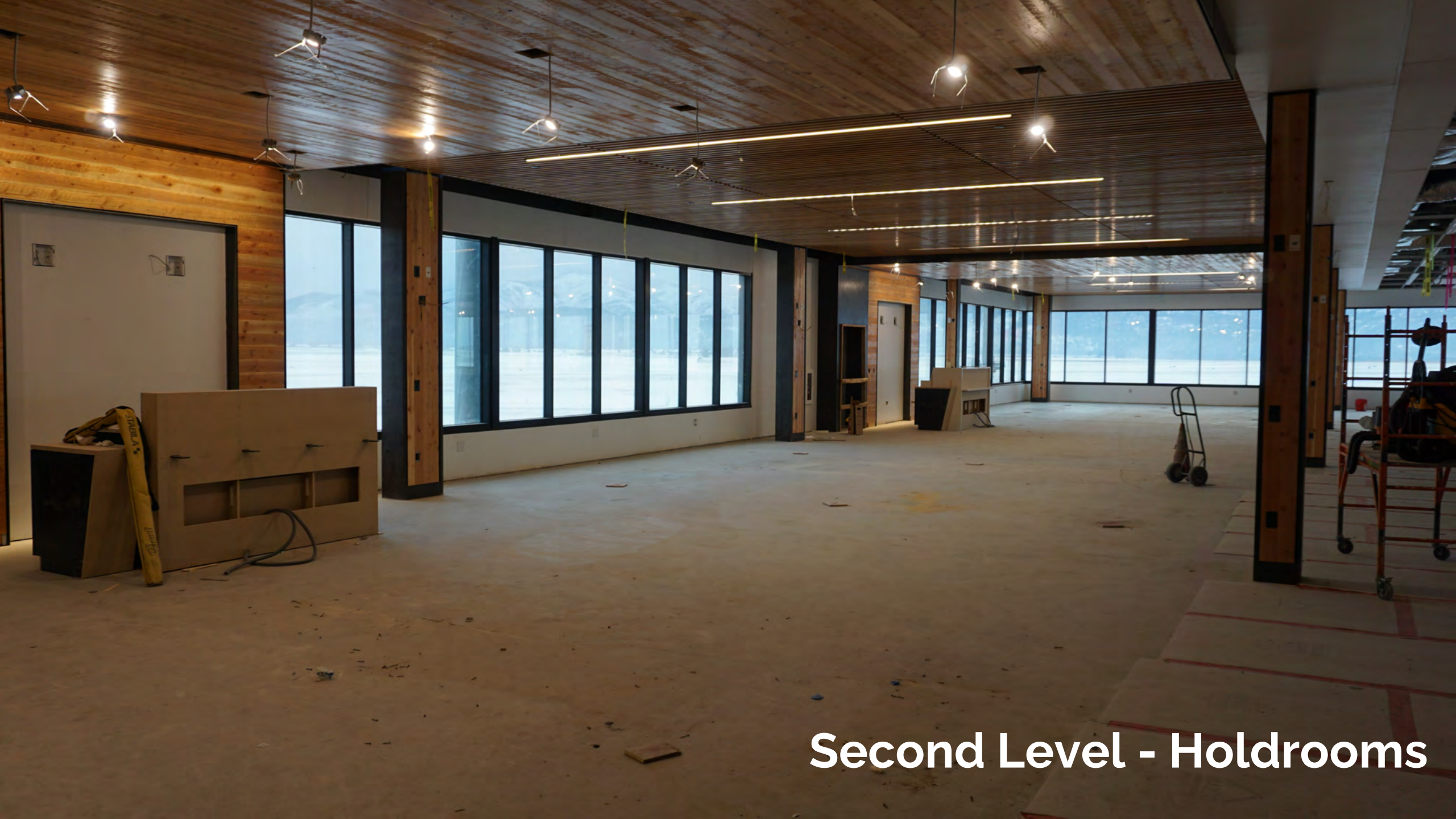
Second Level - Holdrooms