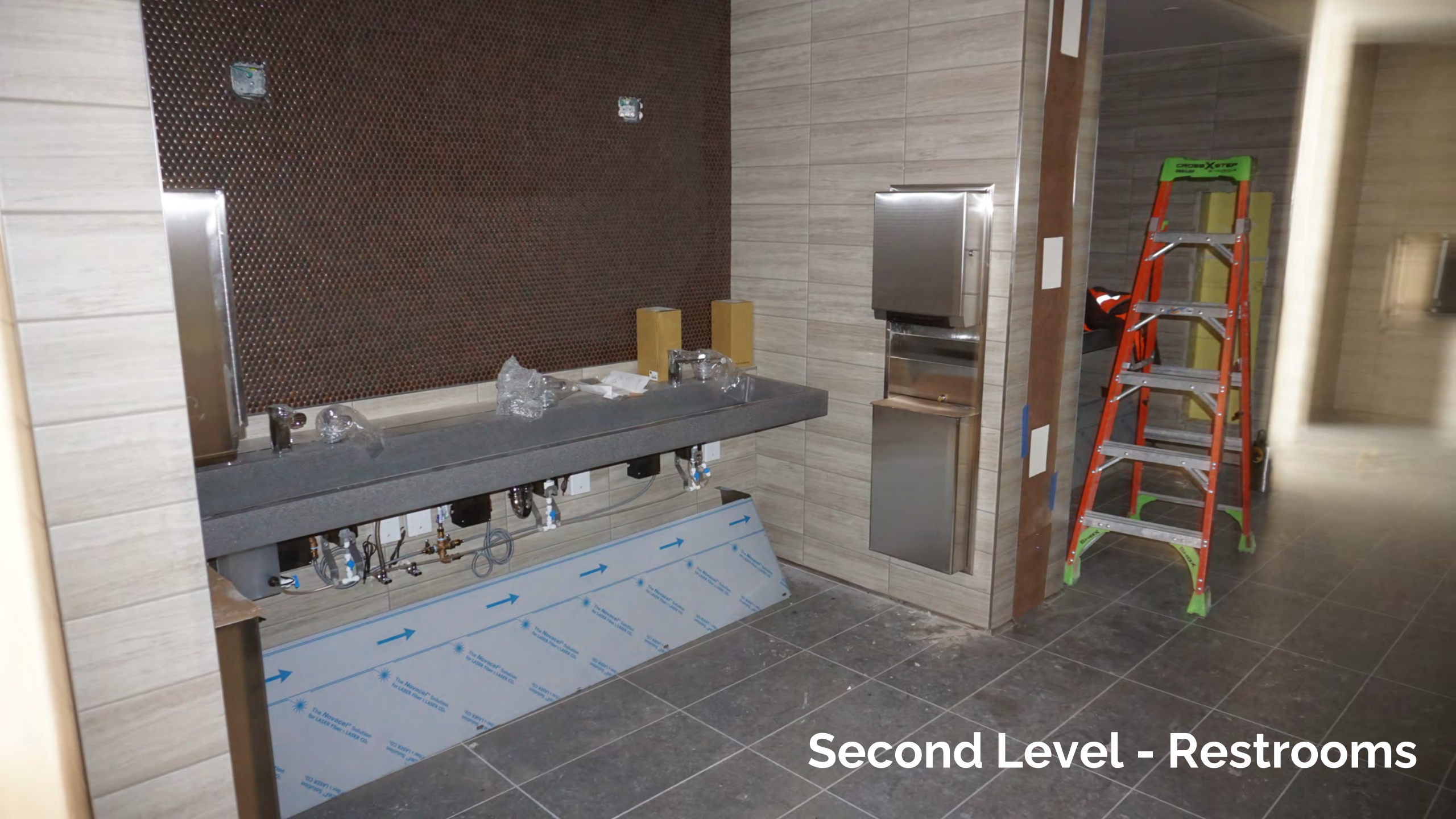
Second Level - Restrooms